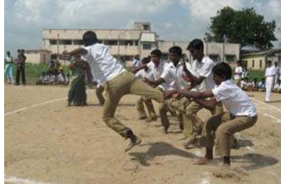
Education Help Day Sports meet (Jan 17, 2009)