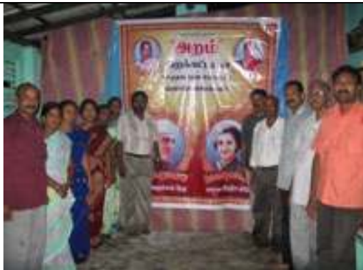
Curtain raiser for Nehru and Indra Gandhi in November 2008.