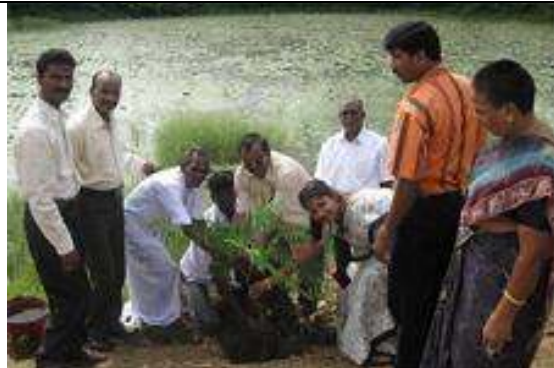
Curtain raiser for the Photo of Mahatma Gandhi and ARAM Trust started Tree Planting.