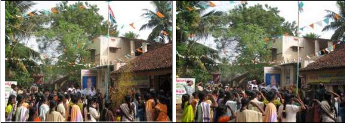
Flag Hoisting ceremony on Republic Day in ARAM Trust