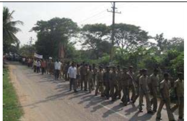
Anti Terrorism campaign by ARAM Trust in Valangaiman, Thiruvarur Dt