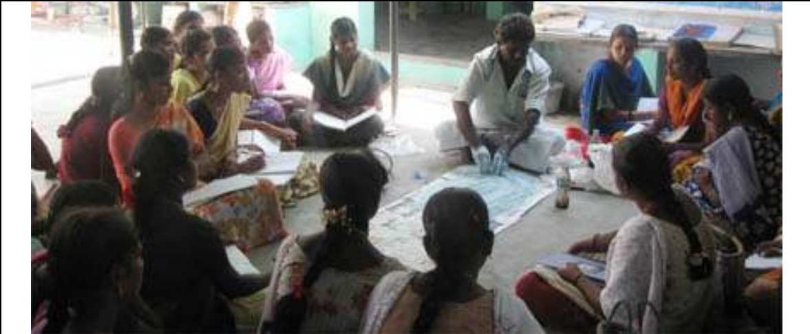
The tutor is explaining about the steps of making "Washing Powder".