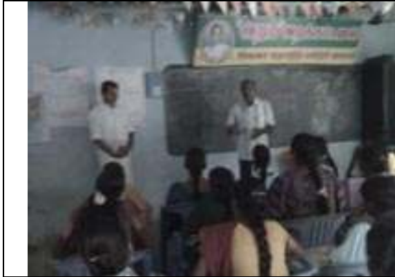
Political Awareness by Mr. Senthil Balaji, MLA, Karur constitution.