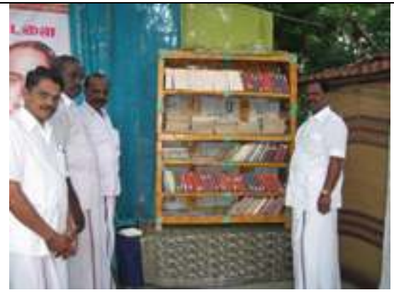
Collection of books for display by ARAM Trust