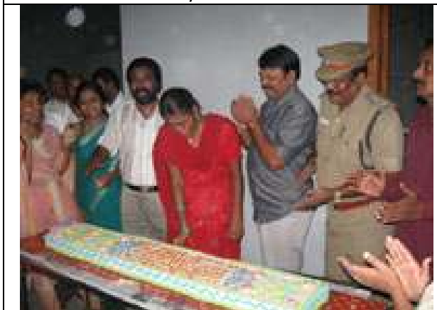
Birthday Celebrations for the Month of Nov 08.