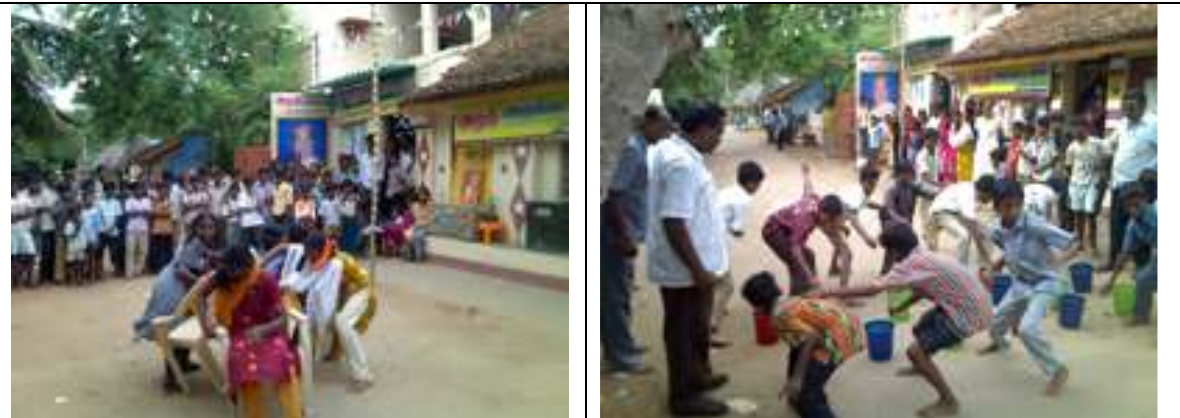
Independence Day (15-Aug-2008) Sports Meet

ARAM Trust has conducted sports meets and competitions for 5 times in this year. It was happened on Independence Day, Christmas Day, Republic Day, during Education Help in Jan 2009, and District Level Sports Meet in Feb 2009.