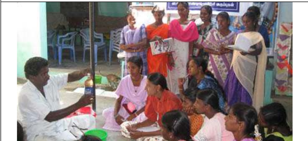
Practical Session about making "Phenol". The peoples are actively involved in the session.