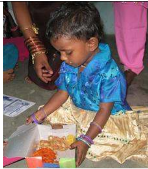
Peoples are enjoying with their sweets.