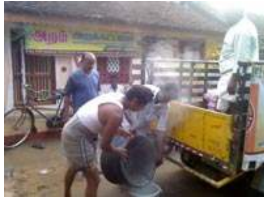
Food Packets, Hot Water, Milk Preparation and getting ready for distribution.