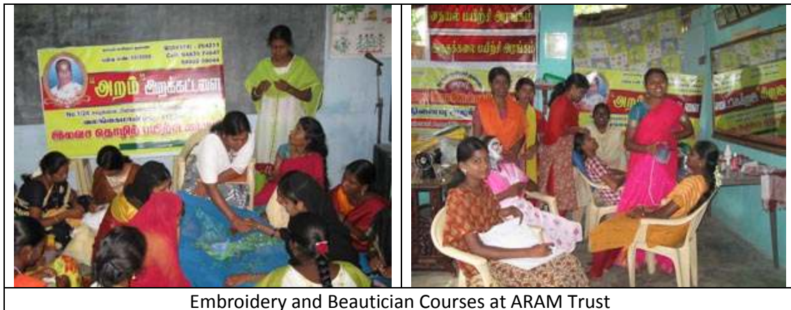
Embroidery and Beautician Courses at ARAM Trust

The trust provides embroidery and beautician courses for widows and poor girls at free of cost to make them an entrepreneur. They are empowered to earn a minimum of Rs.2-3k every month from their home by supporting their family. The trust has paved the way for the school dropout who has completed 18 years to secure a job in M/s. Lucas TVS and TI Tires (located in Chennai).