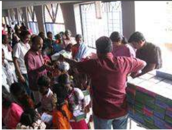
The Sweet Boxes are being distributed.