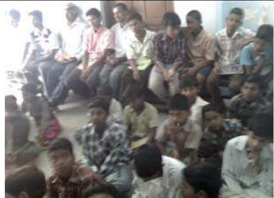
Silent observation of the students