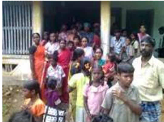
Water...Water... Everywhere... and the affected Citizens of India

ARAM Trust had started their service immediately during the cyclone. ARAM Trust has provided food for 2850 peoples for 4 days and it's distributed nearly 15,000 packets of food for elders, 5600 packets of biscuits and milk for children's. It also conducted a on the spot medical camp during the rescue operation handled by Military. We have given shelter and food for the military peoples. ARAM Trust has worked with Military, Deputy Collector of Thiruvavarur District and with Revenue officers during that time and provided food and medical aids to the rescued peoples.