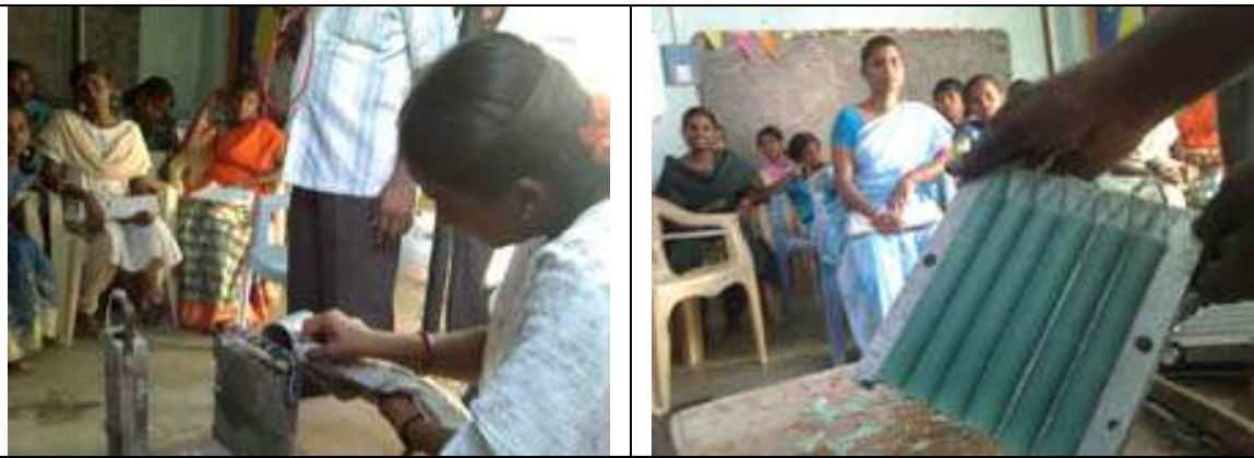
Practical Session about making different types of "Candles" at ARAM Trust