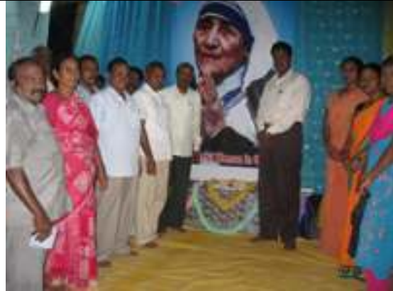
Curtain raiser for the Photo of Mother Teresa in ARAM Trust