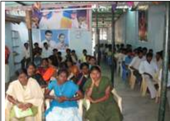
Part of students in the Library Inauguration Function

The Aringar Anna Library was opened on Sep 13, 2008 by ARAM Trust for the students and peoples to acquire general knowledge. This library consists of more than 200 books related to computers and electronics and over 100 books related to general knowledge. Notable collections include Bharathiyar, Bharathidasan and kannadasan. The students are encouraged to avail maximum benefit from these books.