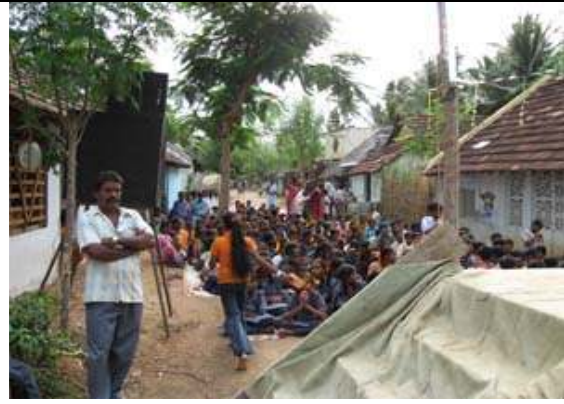
Part of students who got this education help in Valangaiman Taluk