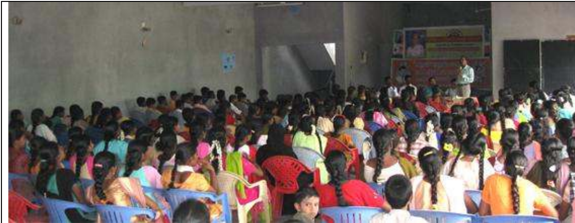
Higher Education and Education Loans Awareness sessions for +1 and +2 students

Awareness, Women Awareness, Women Empowerment, Human Rights, Political Awareness, Fire & Rescue Awareness,