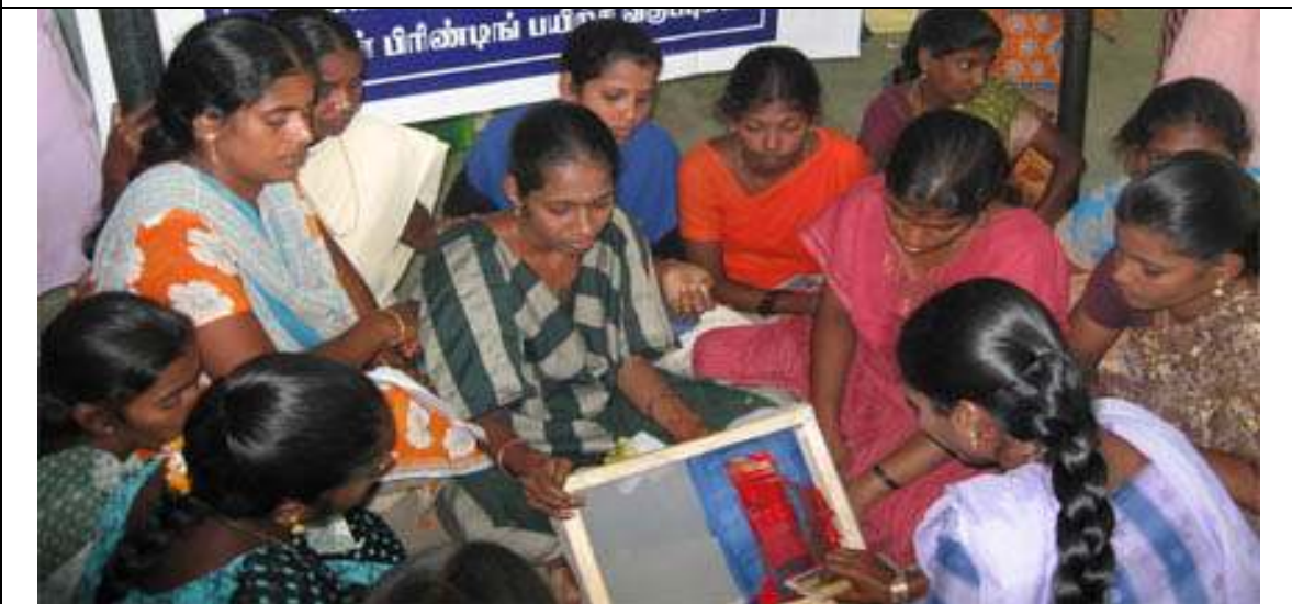
The Students are actively involved in the "Screen Printing" Courses conducted by ARAM Trust