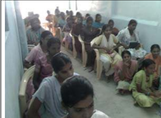
A section of the students in the classroom

The trust is provided free spoken English courses during the last summer for 120 students. 93 of them get passed in their final examinations and got certificate from the District Educational Officer. The next batch is going to commence by this summer and we are planning to give the spoken English courses for 250 students.