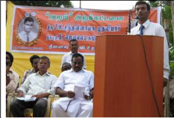
JMK explains about the Free Education Scheme of ARAM Trust in the function