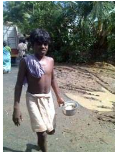
People who affected in flood got food from ARAM Trust