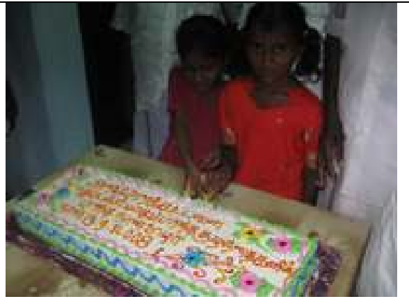
Birthday Celebrations for the Month of Sep 2008