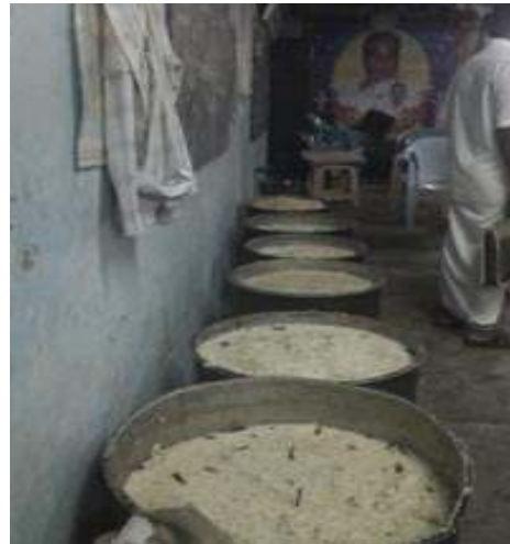
Food Preparation by the Trust