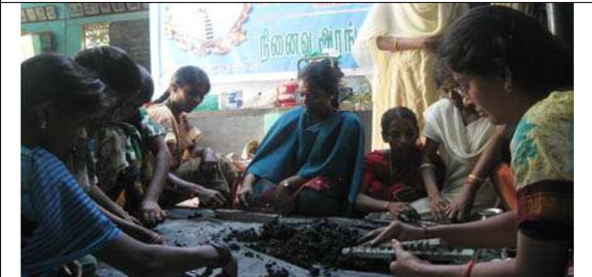
A View of the students is getting trained in "Instance Stick" making at ARAM Trust.