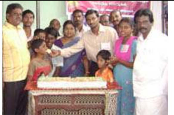
Birthday Celebrations for the Month of Feb 09.