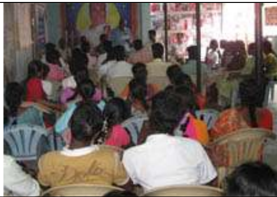
Social Welfare Awareness sessions for youngsters by ARAM Trust