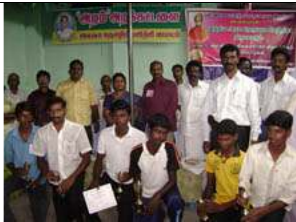
District Level Sports Meet in February 2009.