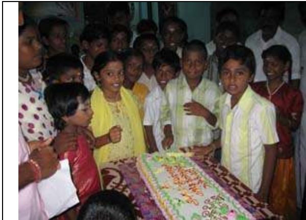
Birthday Celebrations for the Month of Aug 2008

The trust believes that all are children's of God and ever body has a reason to born in this world. The Last Sunday of every month will be the celebration of birthday for the students and staffs whose birth day falls in that particular month. Previously the Celebration of birth days is a night mare for them and they can only dream it or see it in a film. Now the dream has become reality. From the month of August 2008 ARAM Trust is celebrating the birthdays on last Sunday of every month.