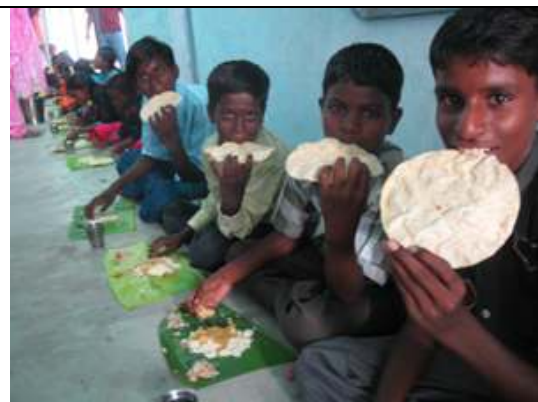
The Students taking their Free Evening Food