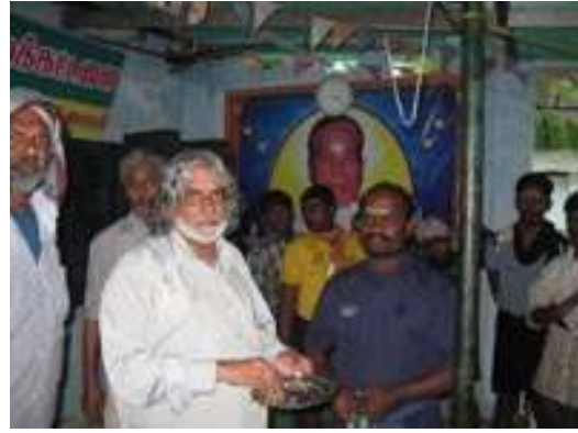
The Food was tasted and tested by the Dy. Collector of Thiruvarur.