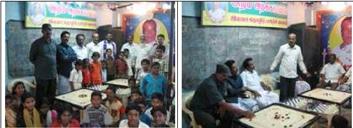
The Sports Utilities are given to the ARAM Trust Students

ARAM Trust has given the sports utilities to the Tuition Centre Students. The students can make use of the Chess, Carom board from 4:15 to 5:15 PM before the tuition starts.