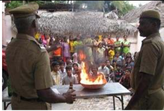
Fire & Rescue Awareness by Fire Department in ARAM Trust