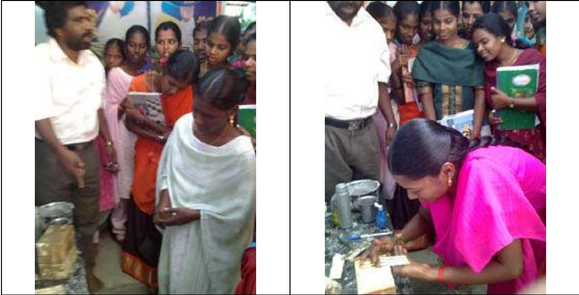
Practical session about making "Chalk Piece" at ARAM Trust