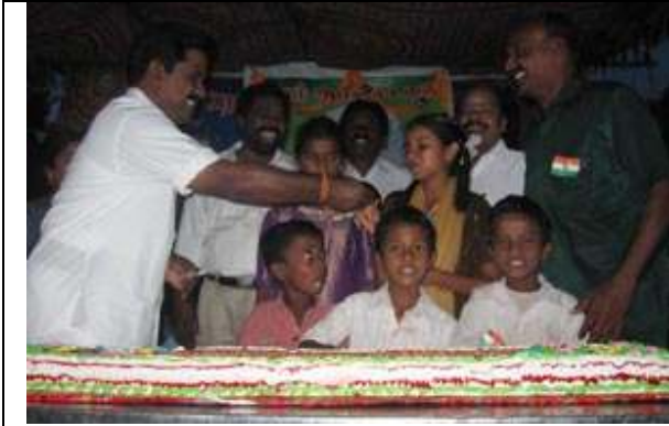
Birthday Celebrations for the Month of Jan 09.