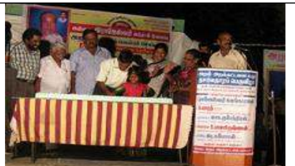
Birthday Celebrations for the Month of Oct 08 with a whopping 12 kg cake.