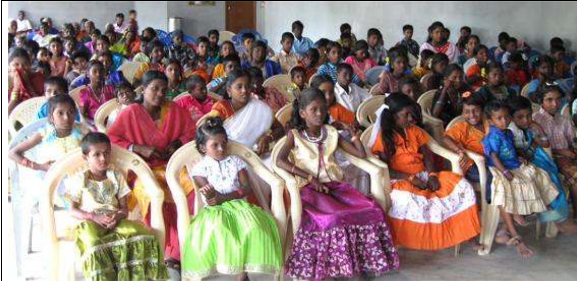
The View of the children who celebrated Deepavali in ARAM Trust