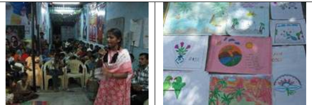
Speaking and Drawing Competition on Christmas Day Celebrations