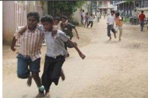
Republic Day (15-Aug-2008) Sports Meet