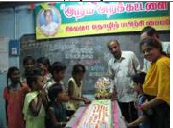
Birthday Celebrations for the Month of Dec 08.